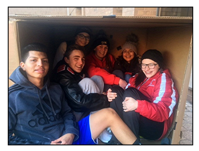
Members of the Monroe High School Interact Club participate in Homeless Awareness Week.