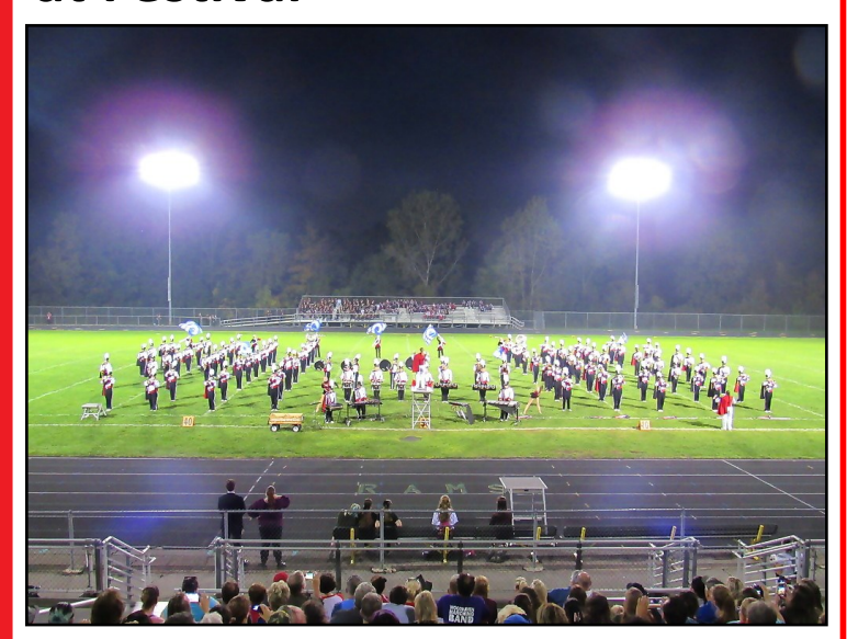
The Trojan Marching Band gave a stellar performance and earned a "Straight Ones" division rating at MSBOA Marching Band Festival on October 8 at Flat Rock High School.