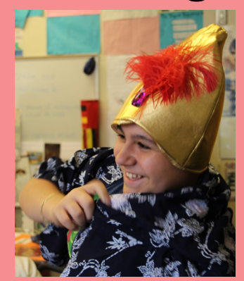
Students were able to sample food and clothing from cultures all across the globe.

Monroe Middle School seventh graders in Jacqueline Pecora's social studies classes traveled the globe right inside room 407. Perusing food, artifacts, activities, and clothing from around the world, these middle school students learned about different cultures with adult guests teaching them from different perspectives.