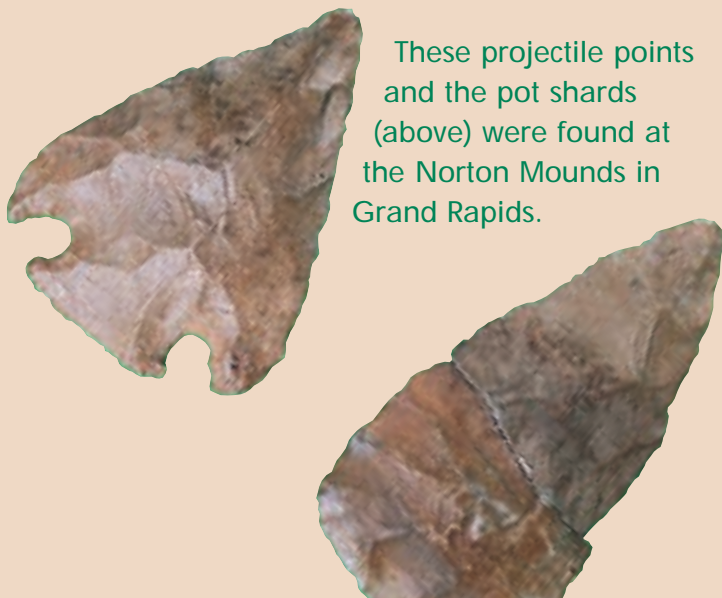
These projectile points and the pot shards (above) were found at the Norton Mounds in Grand Rapids.

Today, Native Americans want their ancestors' burial places to remain untouched, so archaeologists usually do not excavate mounds or burials. However, if a burial site is being destroyed or damaged by erosion or construction, sometimes archaeologists can get a special permit to excavate and save the information and artifacts that are threatened.